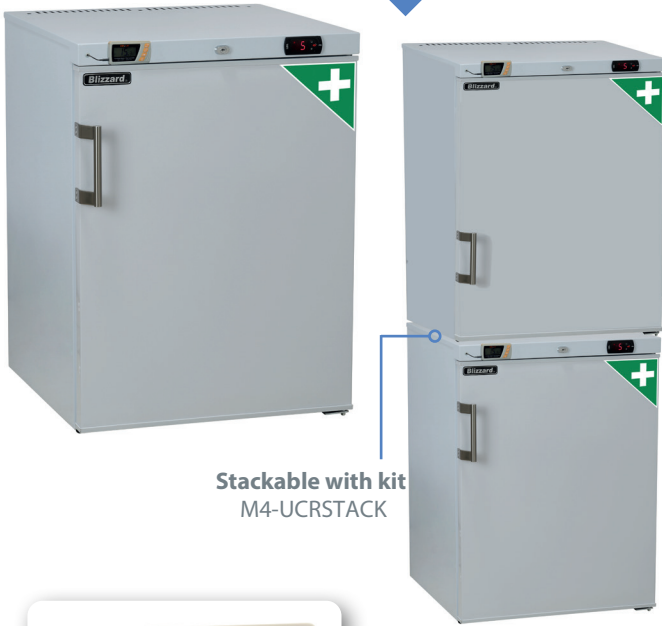
Stackable with kit M4-UCRSTACK